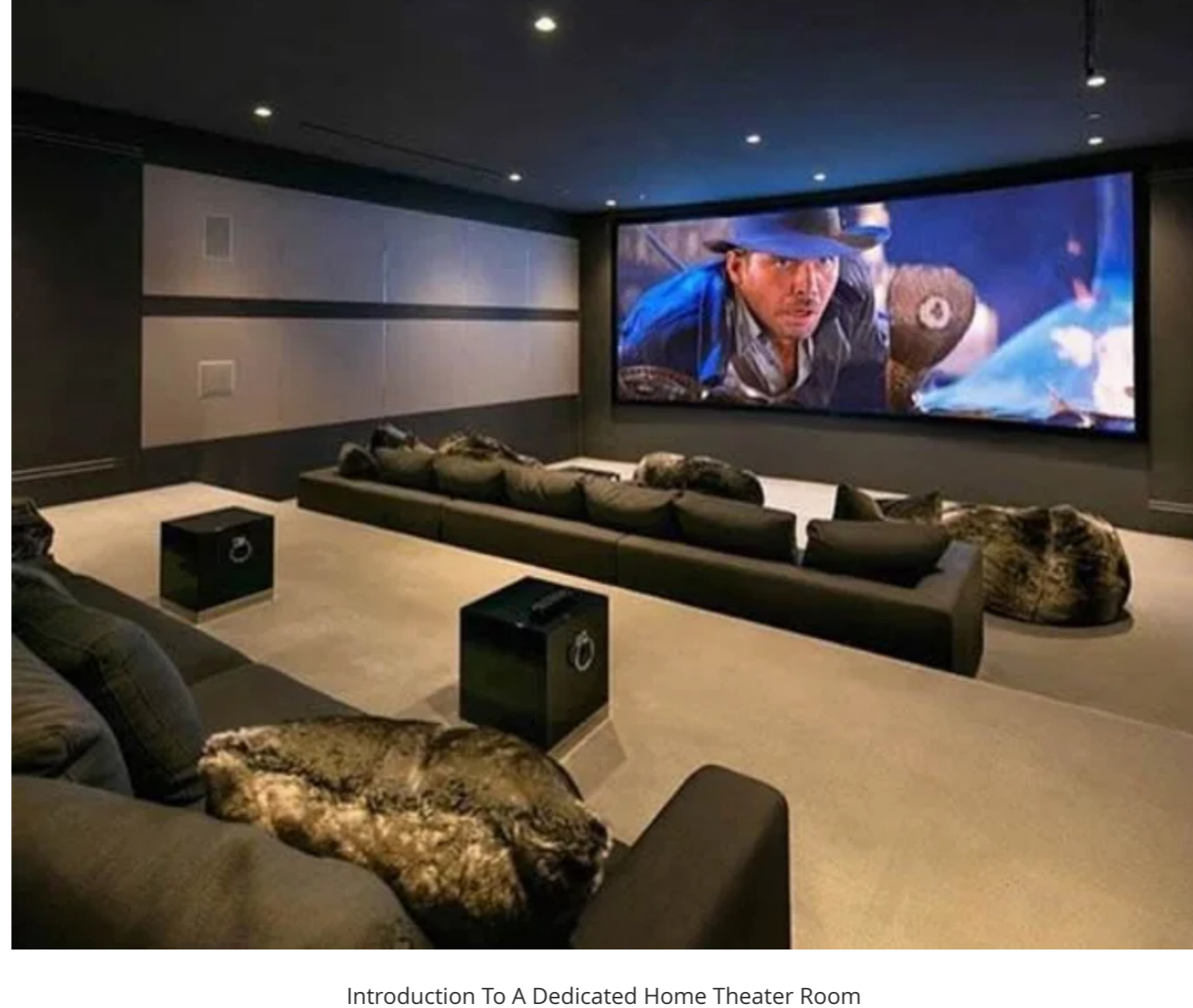
Introduction To A Dedicated Home Theater Room

Start here to learn everything about Home Theater.