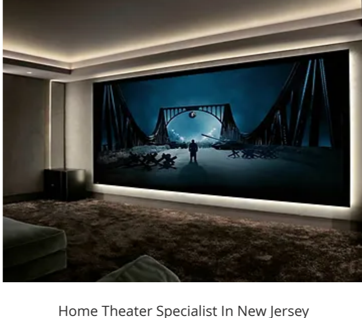
Home Theater Specialist In New Jersey

If you're in the process of searching for an audio-video specialist for building or renovating a home theater at your house, you have plenty to consider. You need a professional that not only is going to take your vision and convert it into reality but also will handle your project with expertise, care and detailed communication throughout the process. Finding the right company for the home theater installation at your house in Chester or throughout the northern New Jersey area can be a difficult process. How do you know you will be making the right choice? Bravo AV is here to help. In this blog entry, the first of a three-part series, we detail what you should be looking for in a home theater specialist and why Bravo AV's customer-centric approach, experience, and technical knowledge make it stand out from other home theater companies.